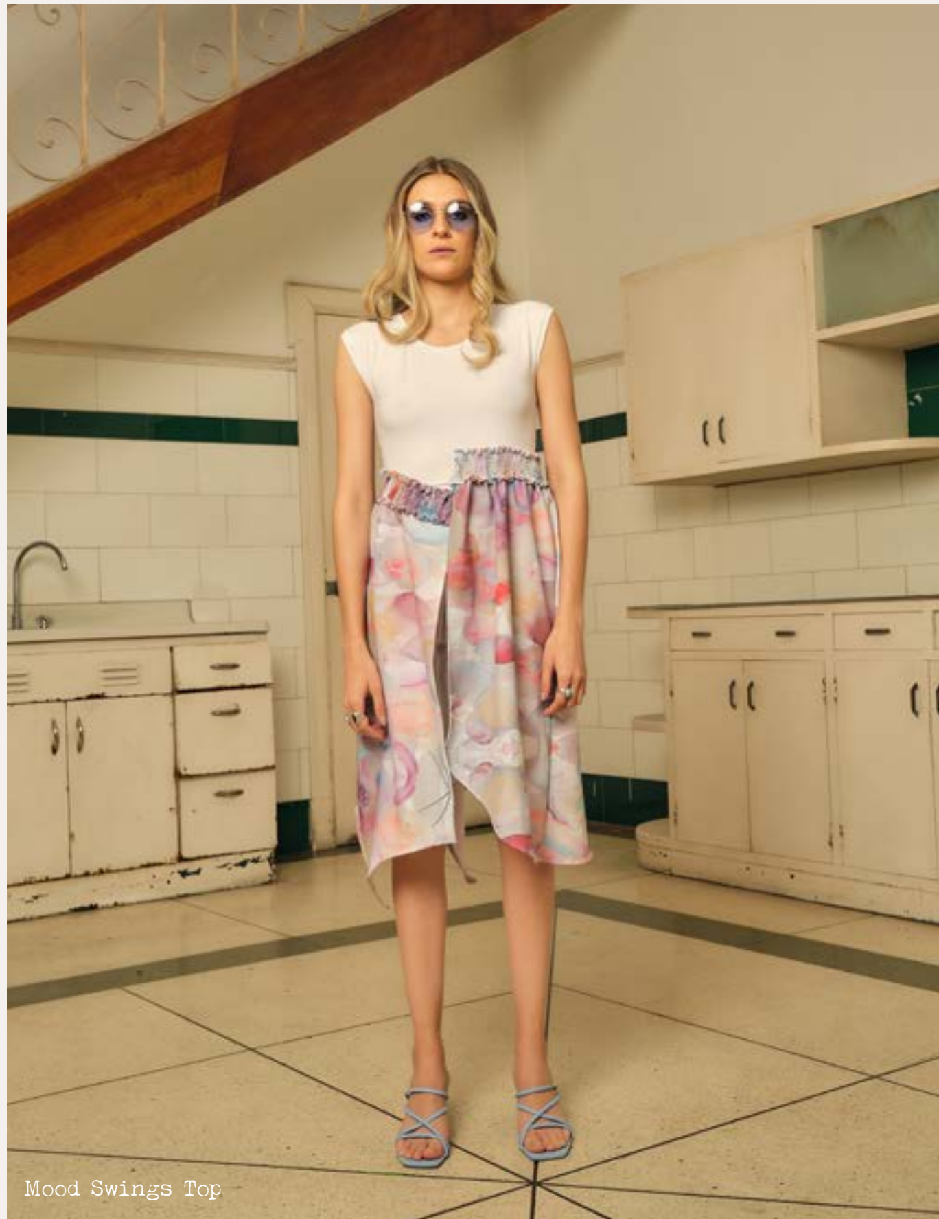
Mood Swings Top