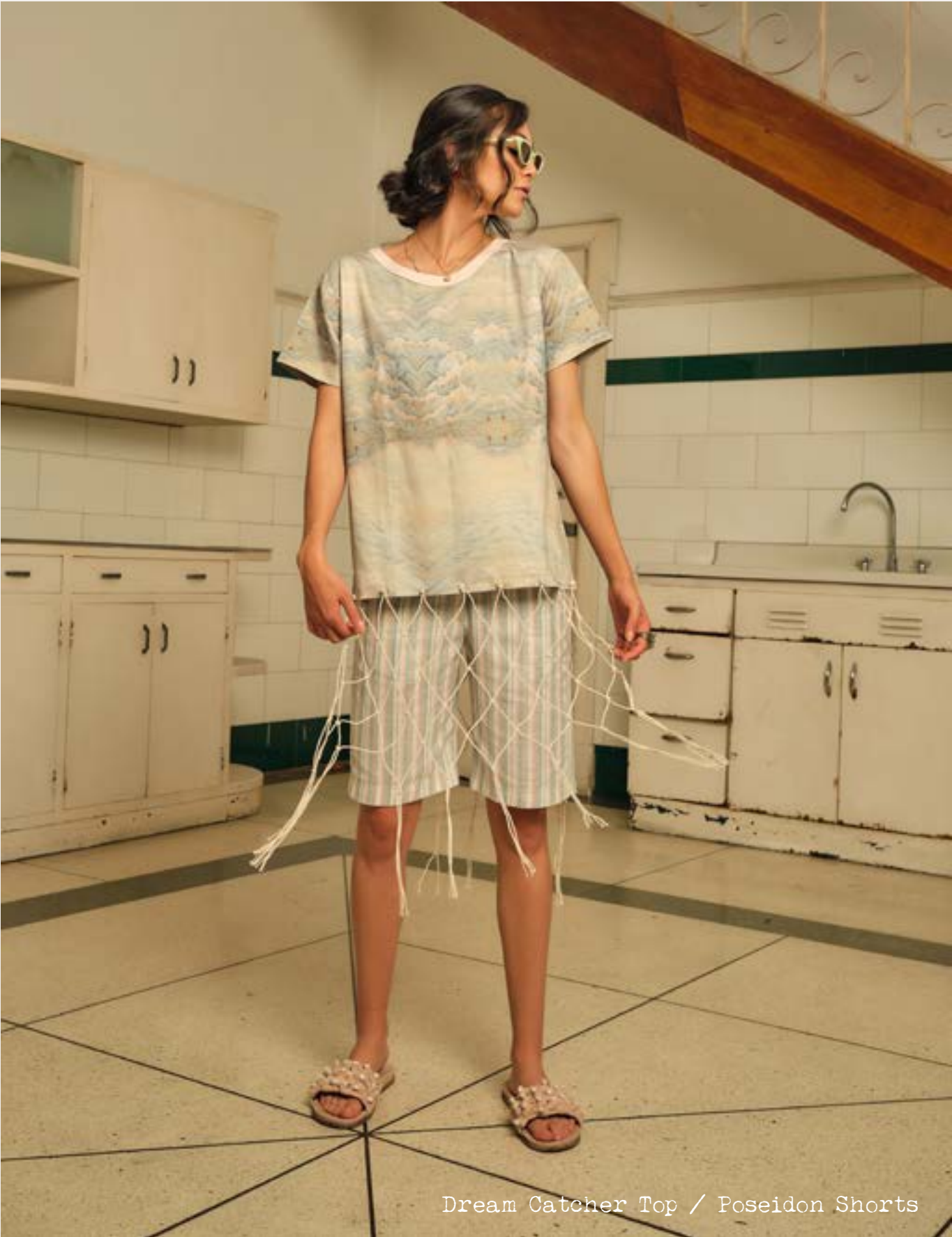
Dream Catcher Top / Poseidon Shorts