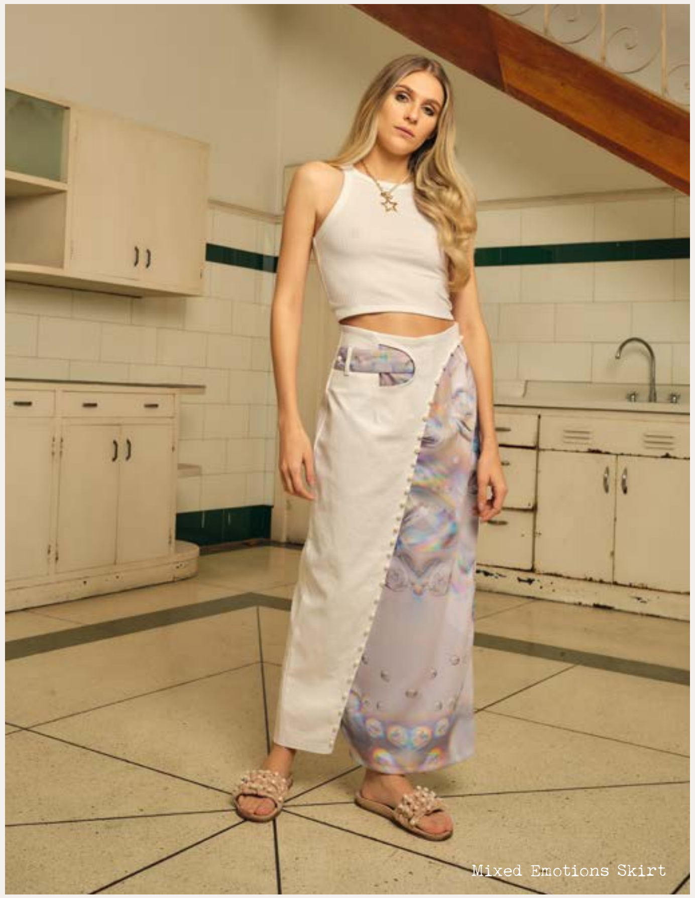
Mixed Emotions Skirt