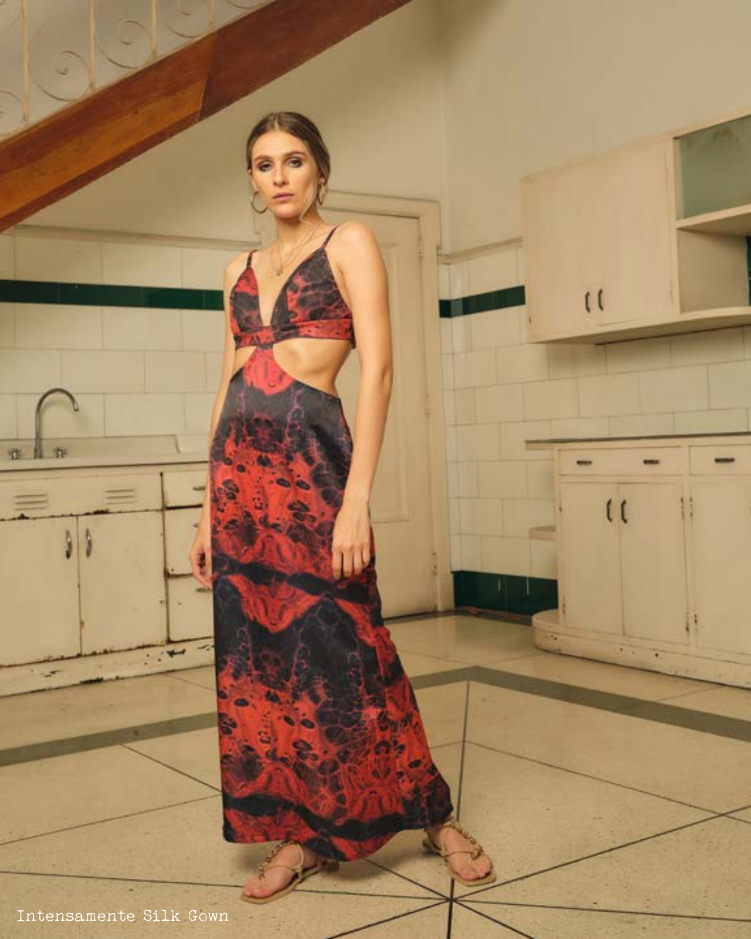
Intensamente Silk Gown

Pyromania Pyromania Pyromania Pyromania Pyromania Pyromania