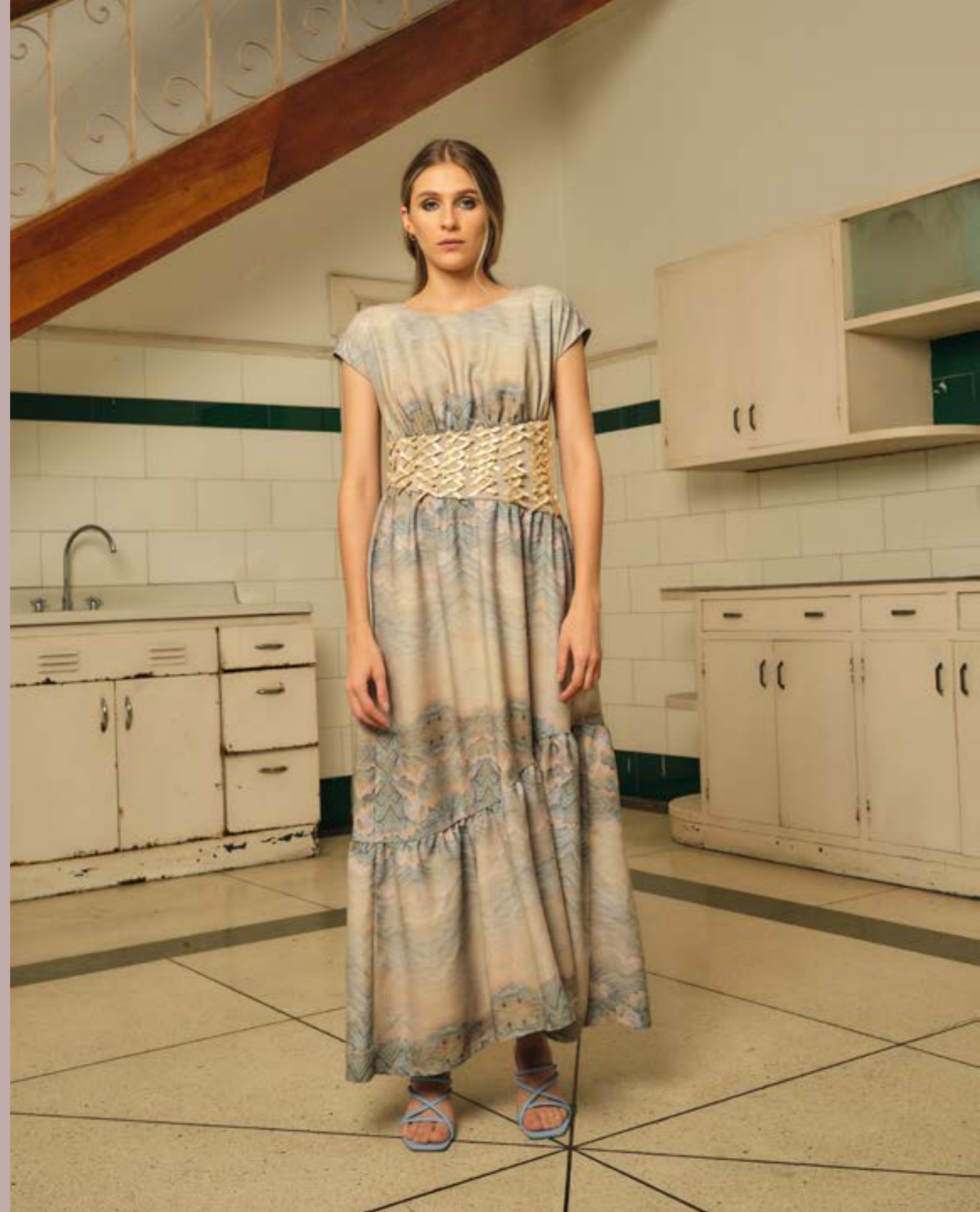
Abrázame Fuerte Corset Dress

Hold me close Hold me close Hold me close