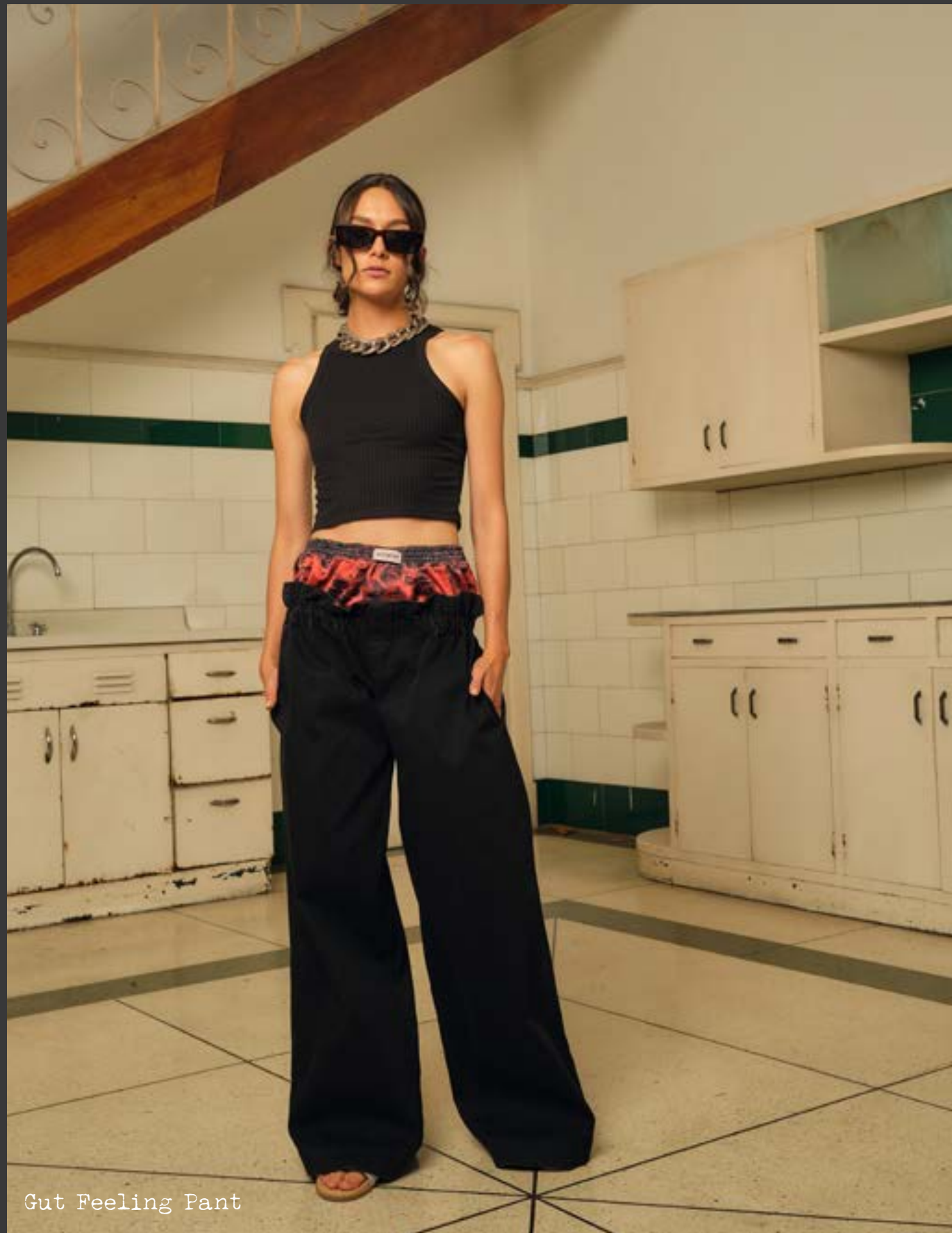
Gut Feeling Pant