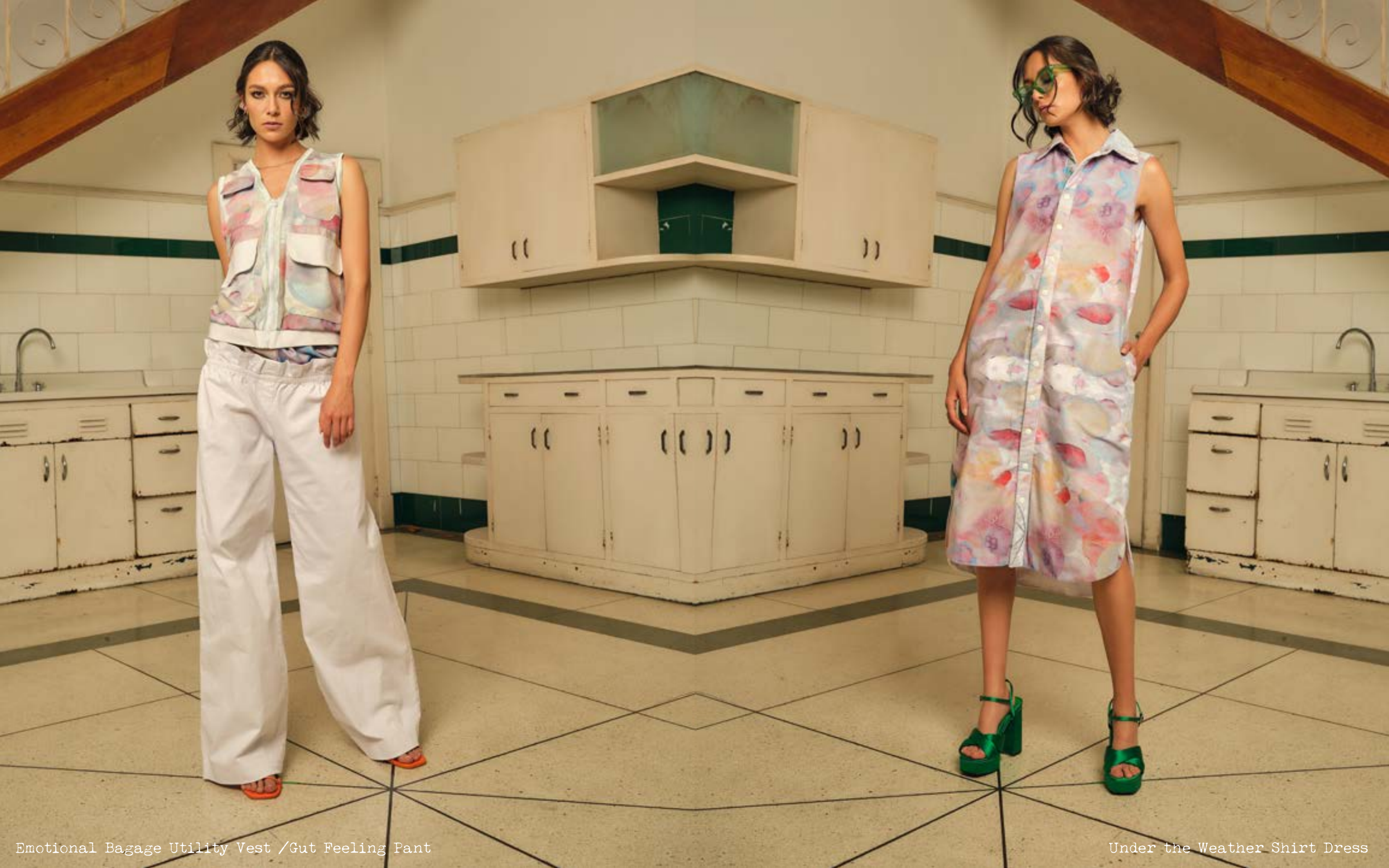
Emotional Baggage Utility Vest /Gut Feeling Pant